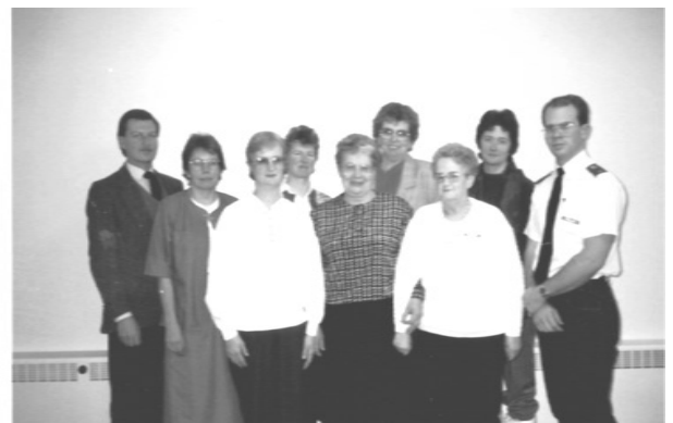
The very First Hospice Board. Can you name them?